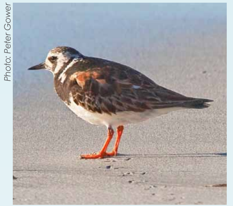
Ruddy Turnstone M