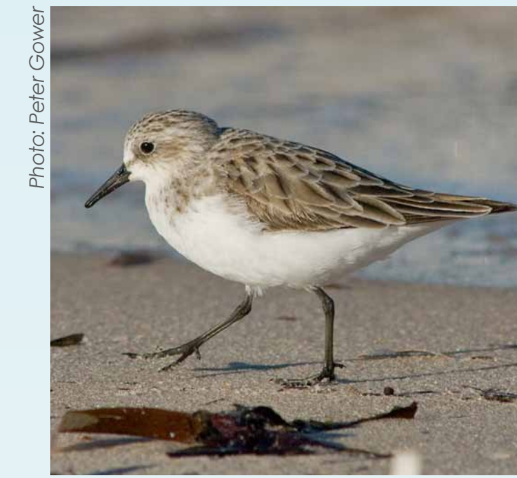
Red-necked Stint M