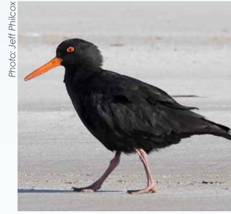
Sooty Oystercatcher R

Key: M = Migratory shorebird R = Resident shorebird