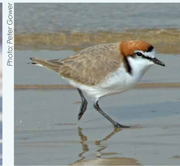
Red-capped Plover R