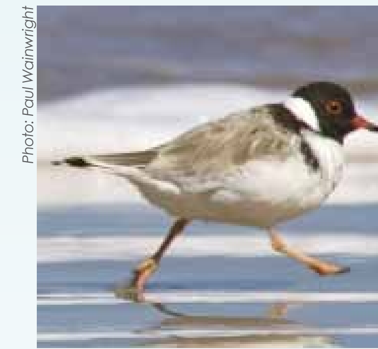
Hooded Plover R