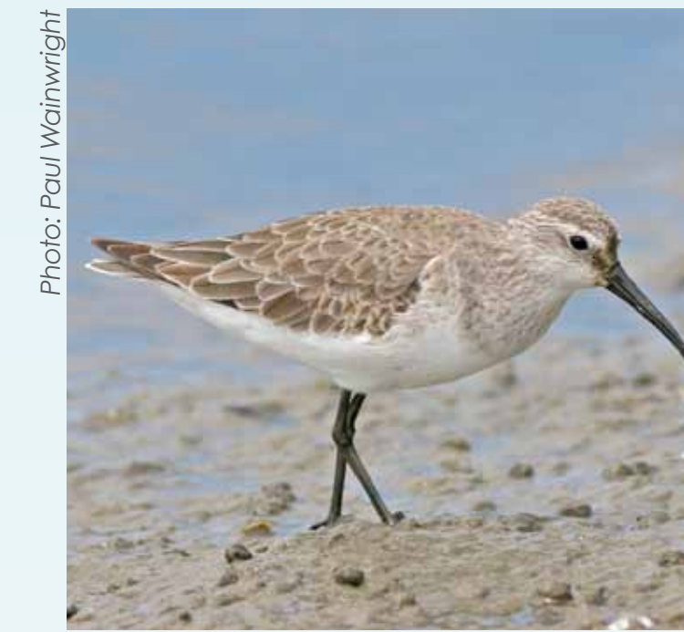
Curlew Sandpiper M