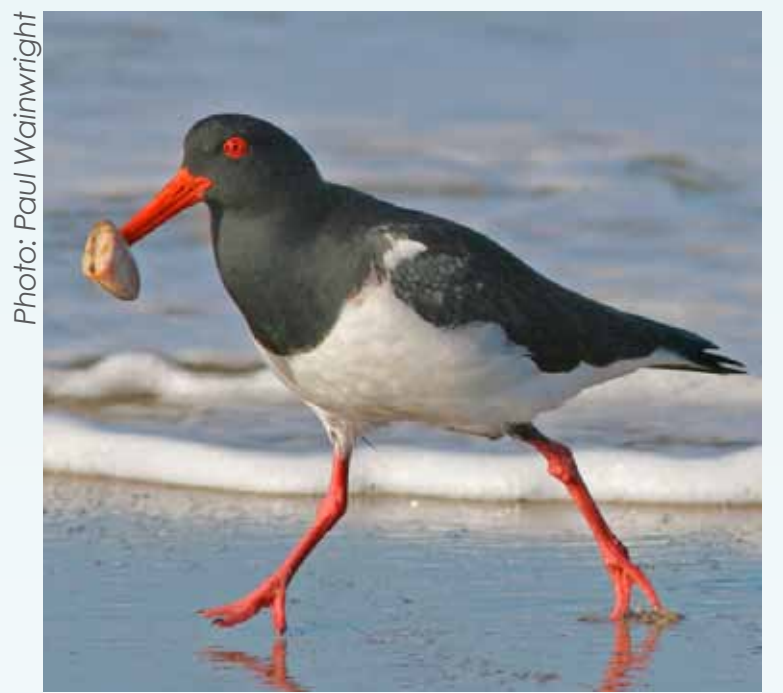
Pied Oystercatcher R

Key: M = Migratory shorebird R = Resident shorebird