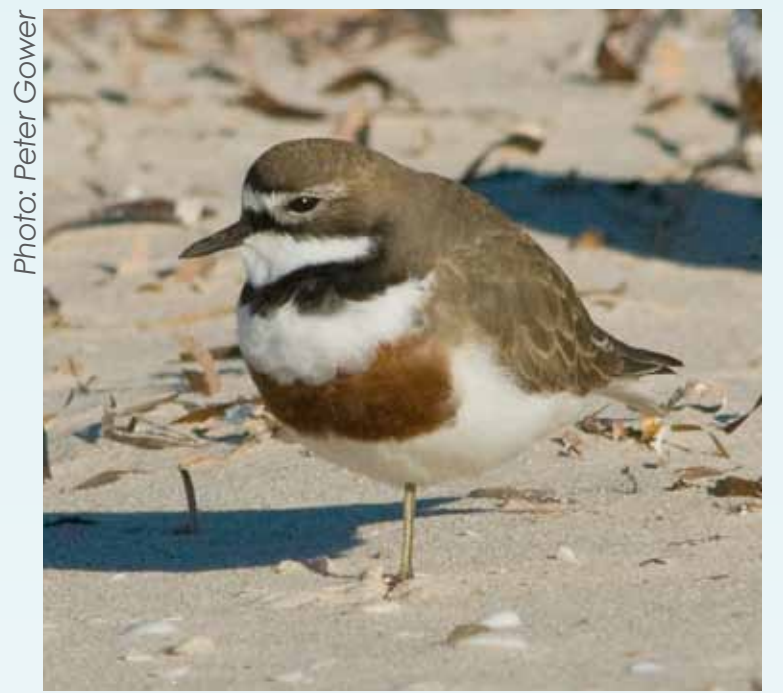
Double-banded Plover M