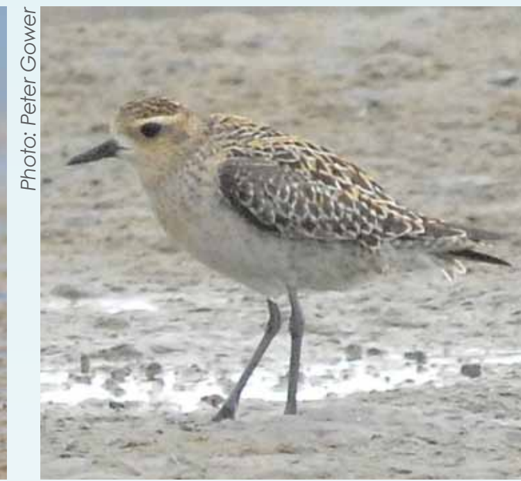
Pacific Golden Plover M