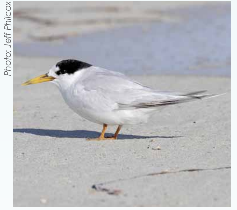
Fairy Tern R