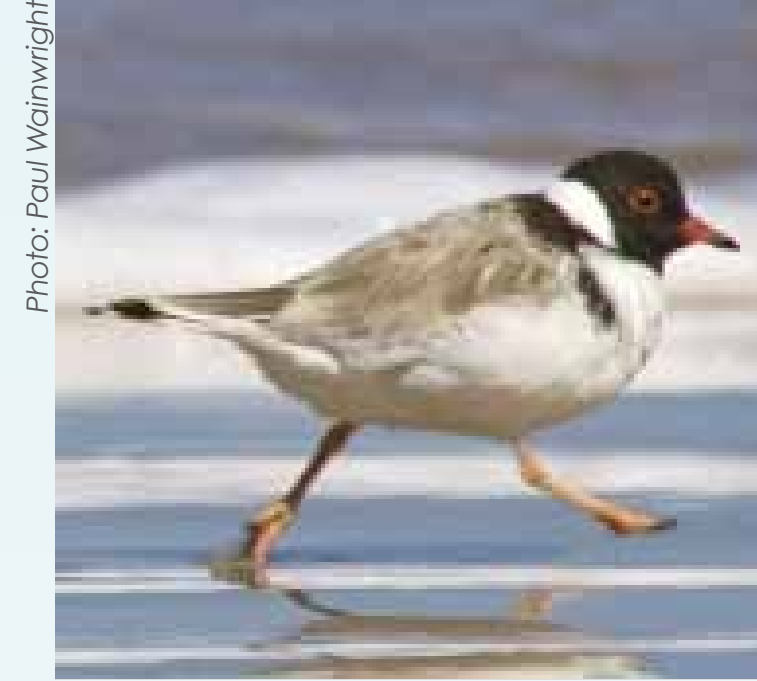
Hooded Plover R