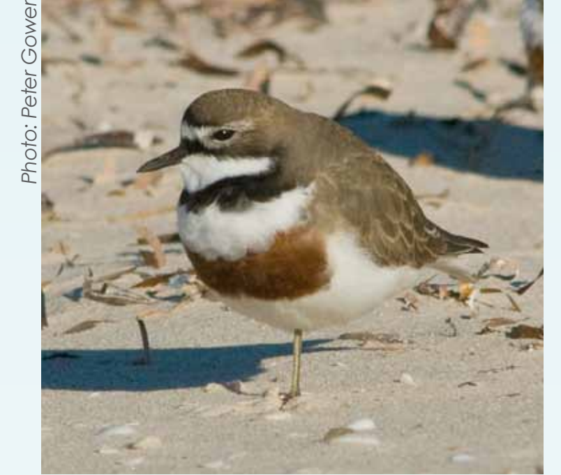
Double-banded Plover M