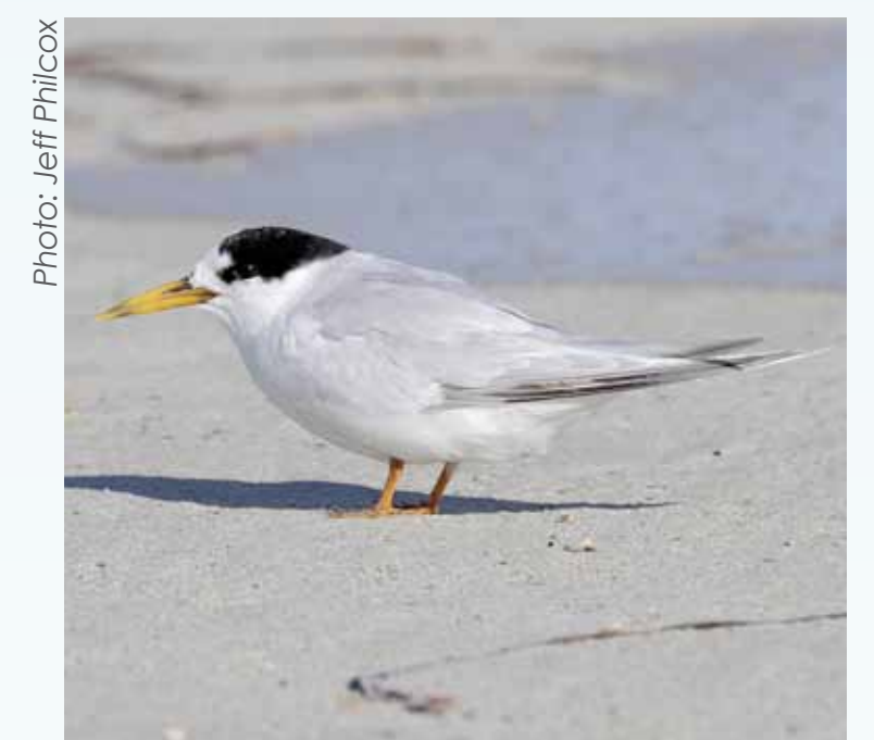
Fairy Tern R

Key: M = Migratory shorebird R = Resident shorebird