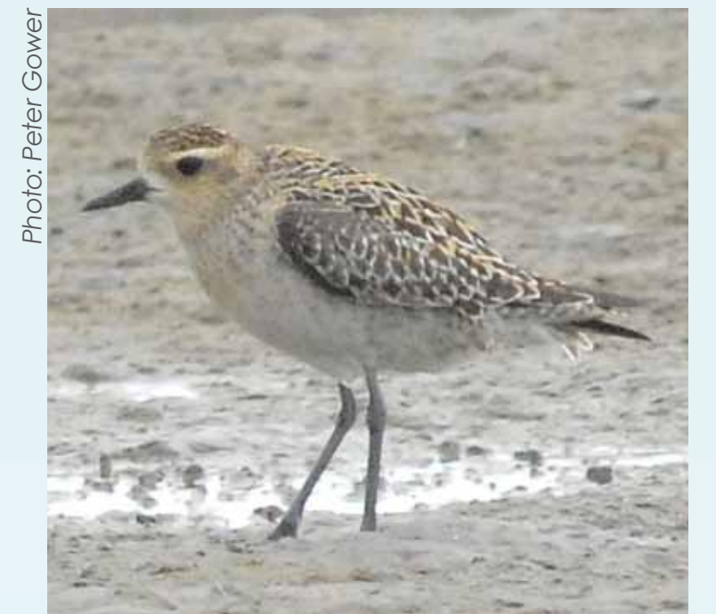
Pacific Golden Plover M