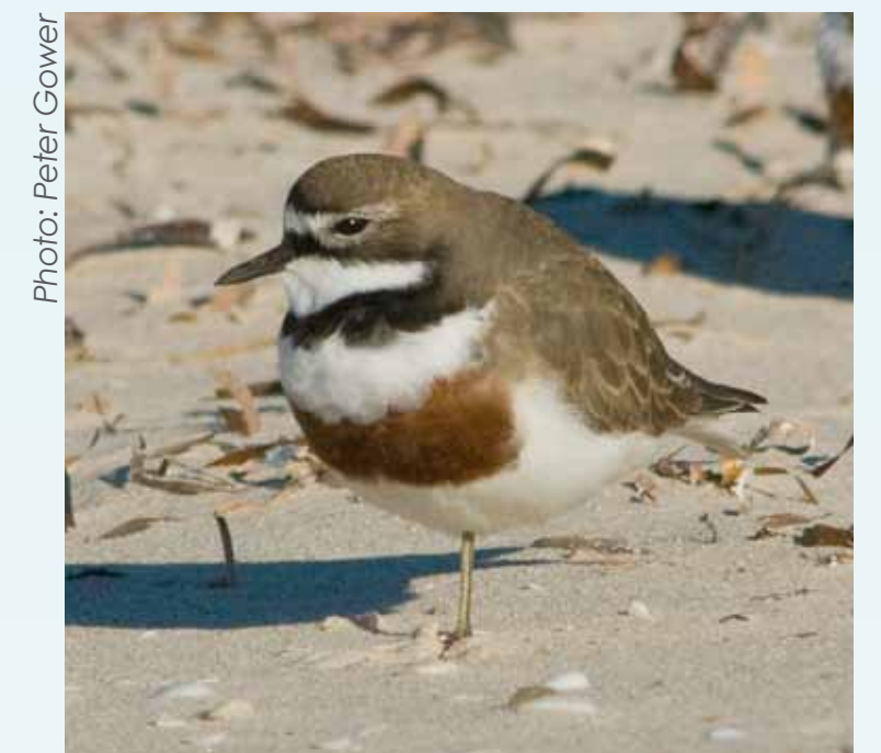
Double-banded Plover M