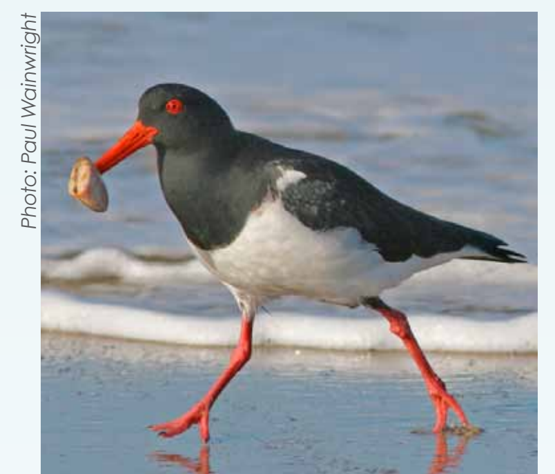
Pied Oystercatcher R