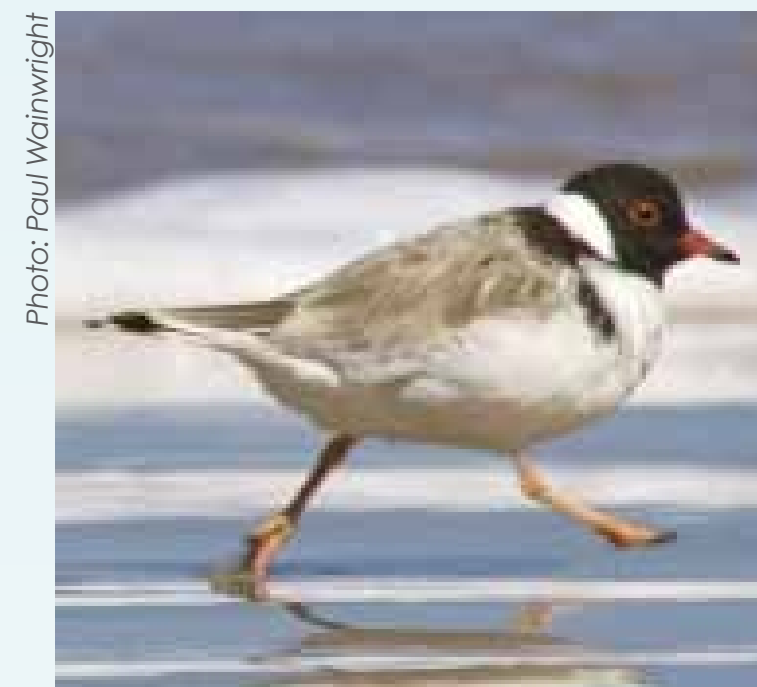
Hooded Plover R