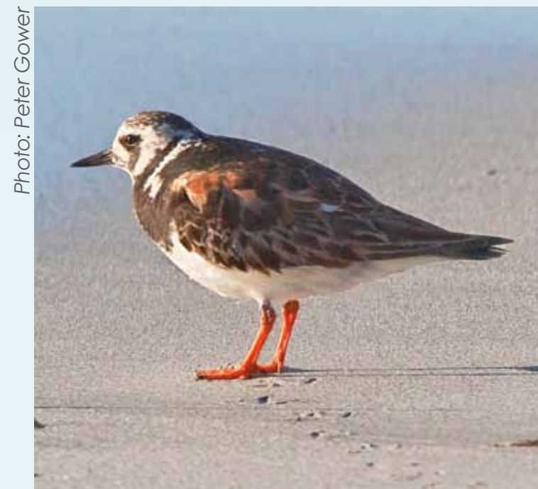
Ruddy Turnstone M