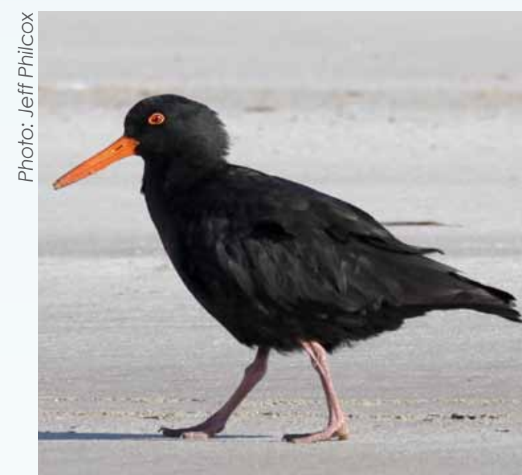
Sooty Oystercatcher R