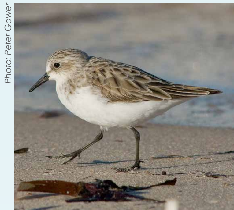
Red-necked Stint M

The Lower South East is an important area for both resident and migratory shorebirds. The resident birds live here all year round and can be seen at any time. Migratory shorebirds come from as far as Siberia to feed along our coast. Most migratory birds arrive any time from September and depart by the end of May to return to their breeding grounds in the Northern Hemisphere. Only one species, the Double-banded Plover, migrates here in the Southern Hemisphere winter, flying in from New Zealand.