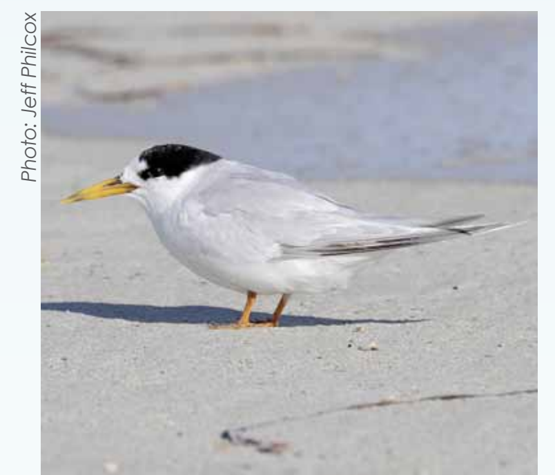
Fairy Tern R

Key: M = Migratory shorebird R = Resident shorebird