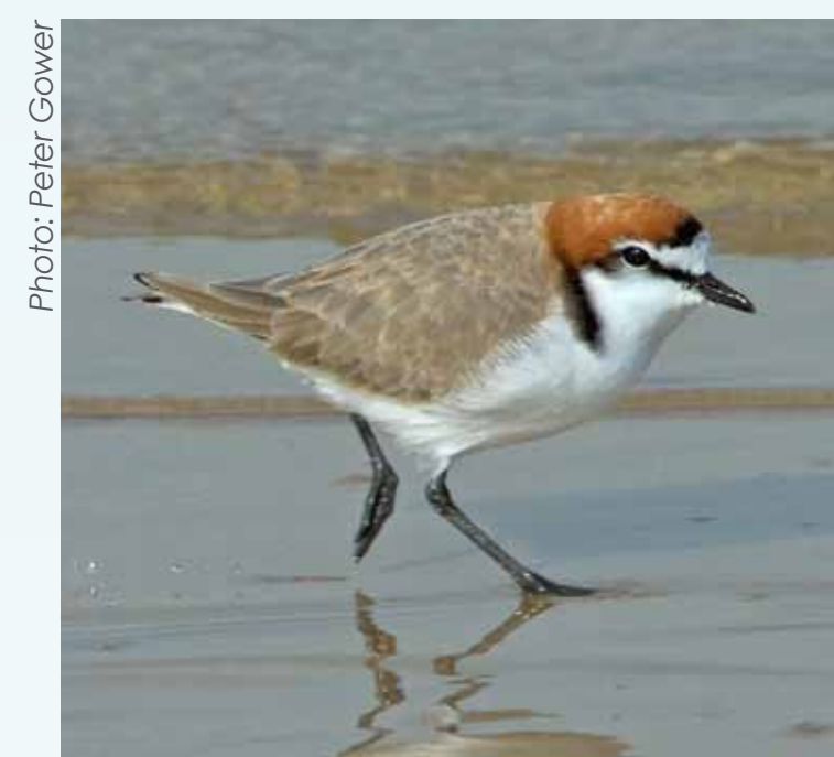
Red-capped Plover R