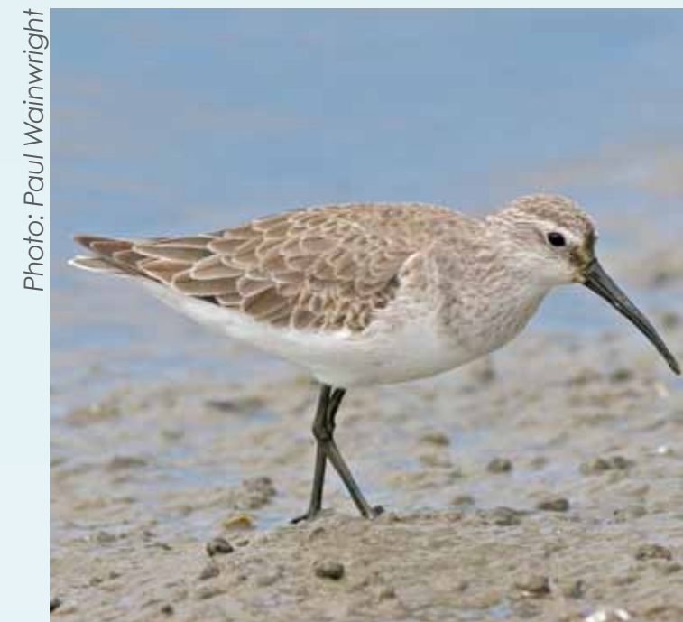
Curlew Sandpiper M