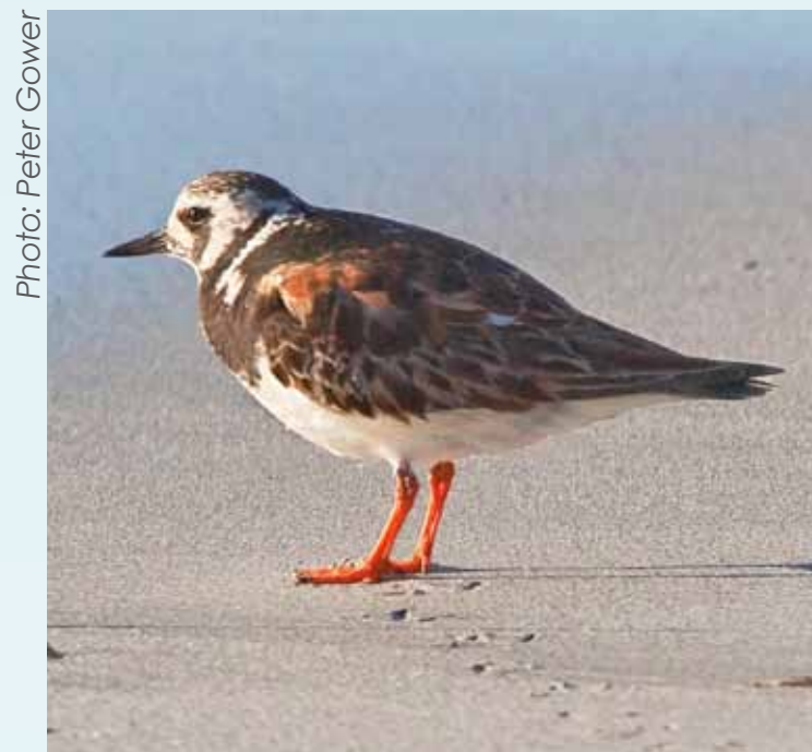
Ruddy Turnstone M