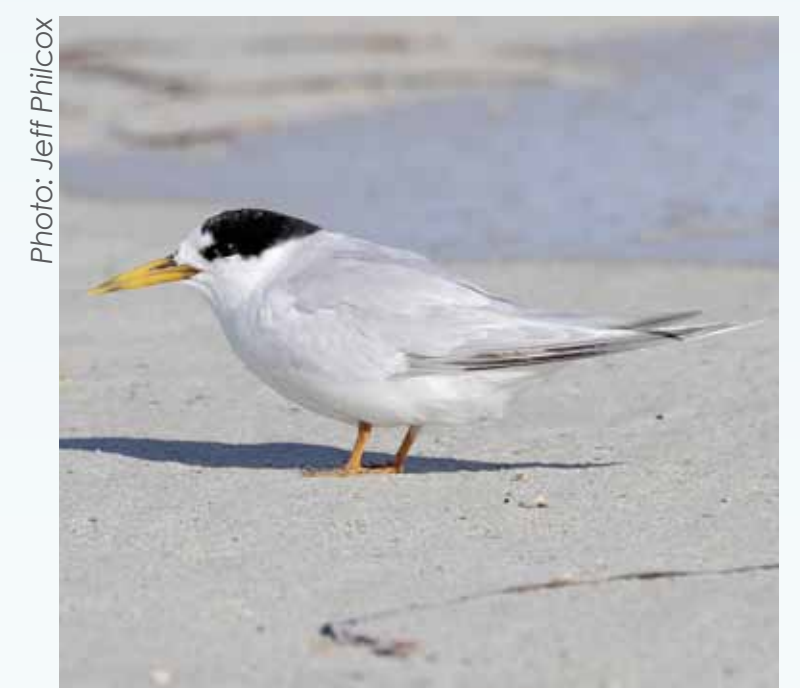
Fairy Tern R

Key: M = Migratory shorebird R = Resident shorebird